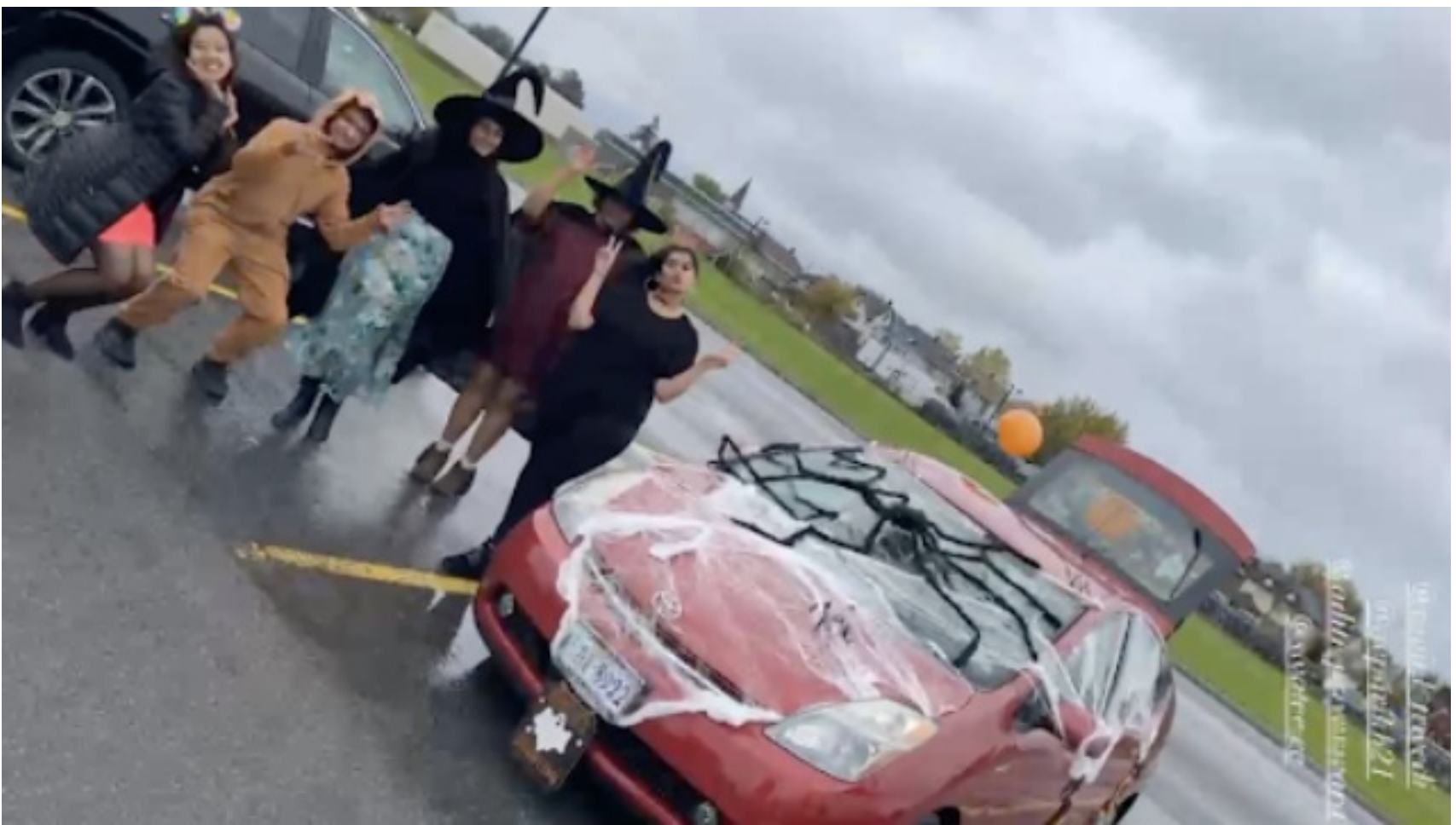
SDM dental students host first annual "Inclusive Trunk or Treat"

On Sunday, October 31st, UBSDM students participated in the First Annual "Inclusive Trunk or Treat" event hosted by AADMD and BOCA! UBSDM students celebrated Halloween with the local community this year, all while spreading the message of inclusion and acceptance of people who have Intellectual and Developmental Disabilities (IDDs).