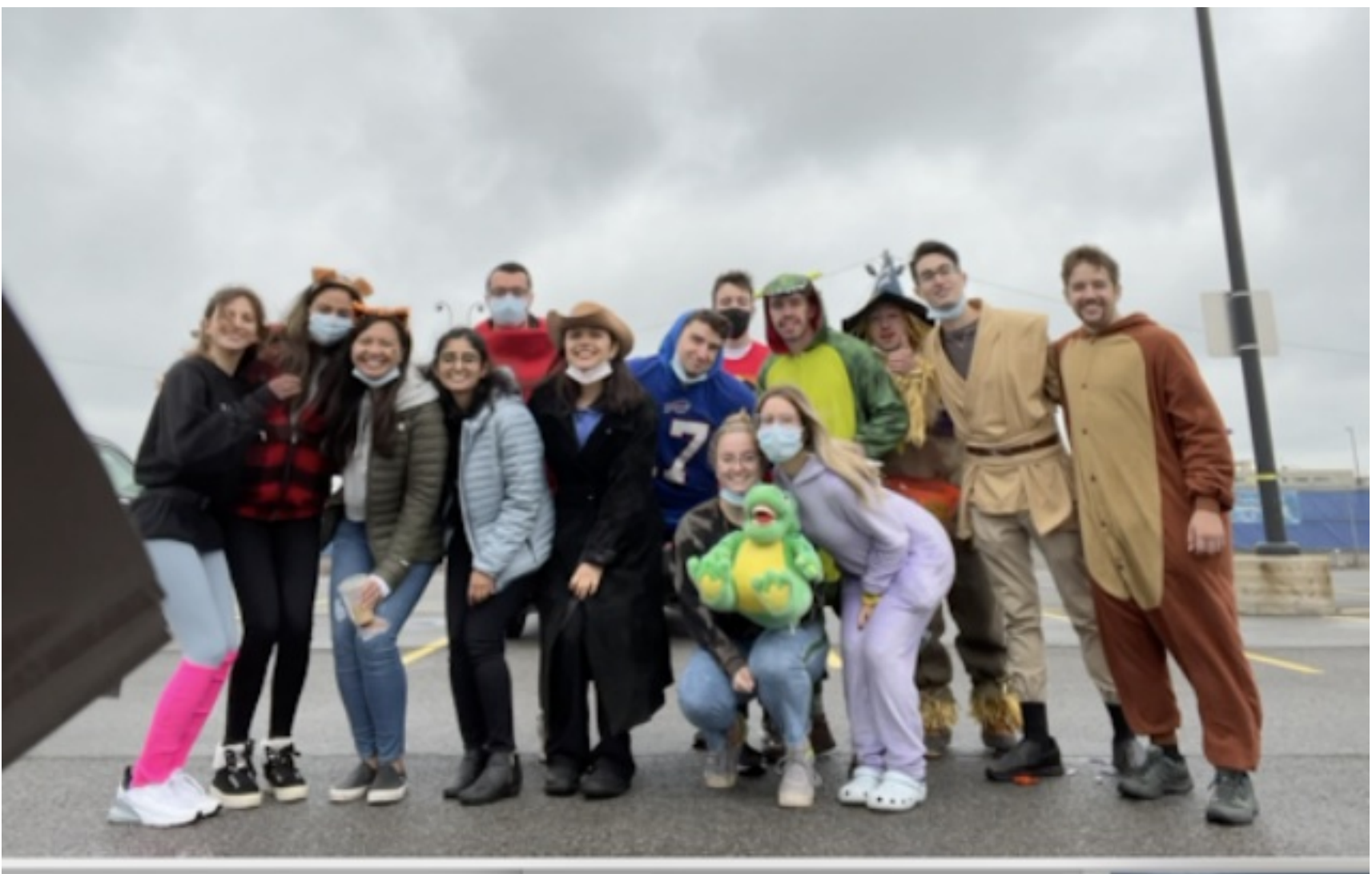
Members of AADMD and BOCA gather in costumes to celebrate Halloween 2021